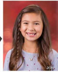
2. Red Lights