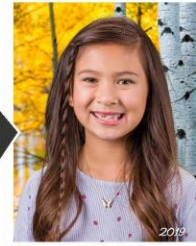
3. Autumn Woods