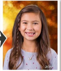
4. Golden Glow