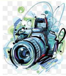
PHOTO RETAKES MONDAY - 11/18