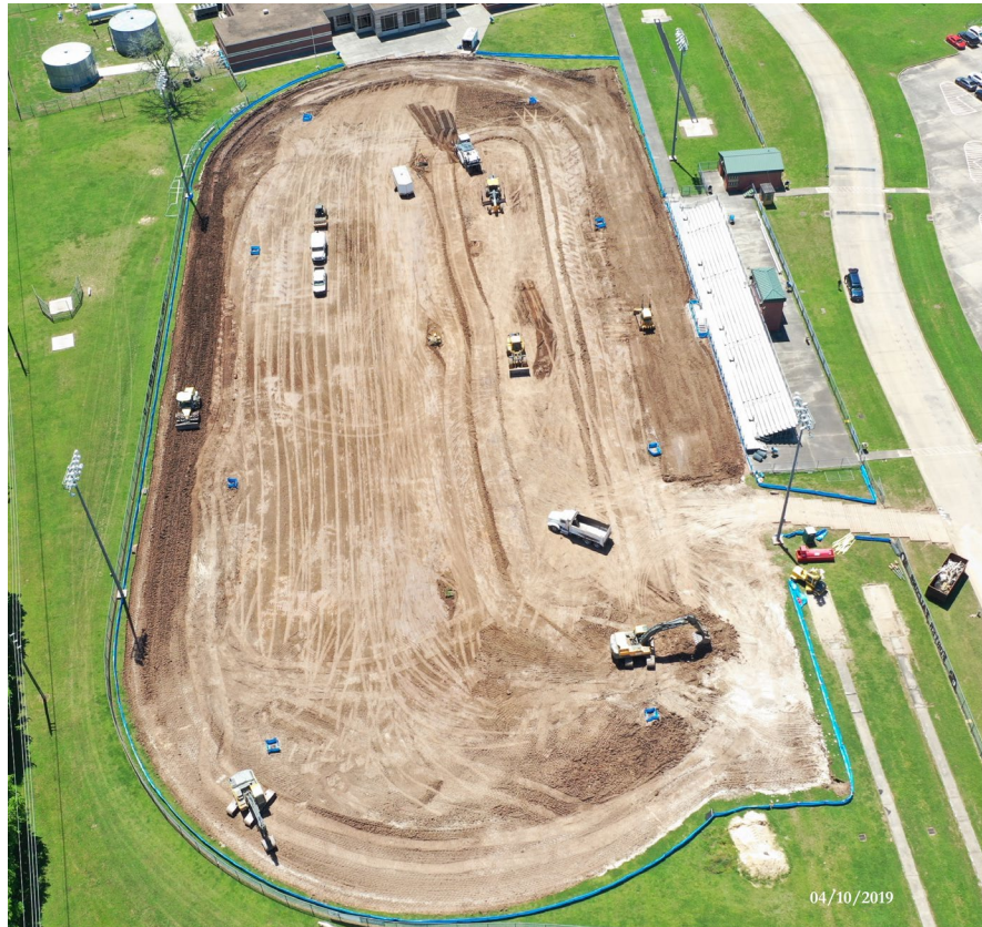
Foster High School