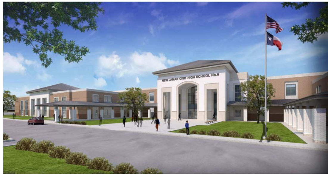
3D ENTRANCE PERSPECTIVE NEW LAMAR CONSOLIDATED HIGH SCHOOL 6 - OPTION 1

LAMAR CISD PRBK A PROUD TRADITION | A BRIGHT FUTURE