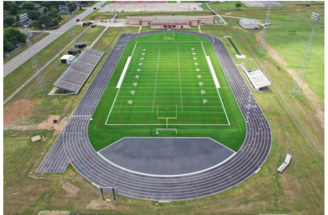
Terry High School