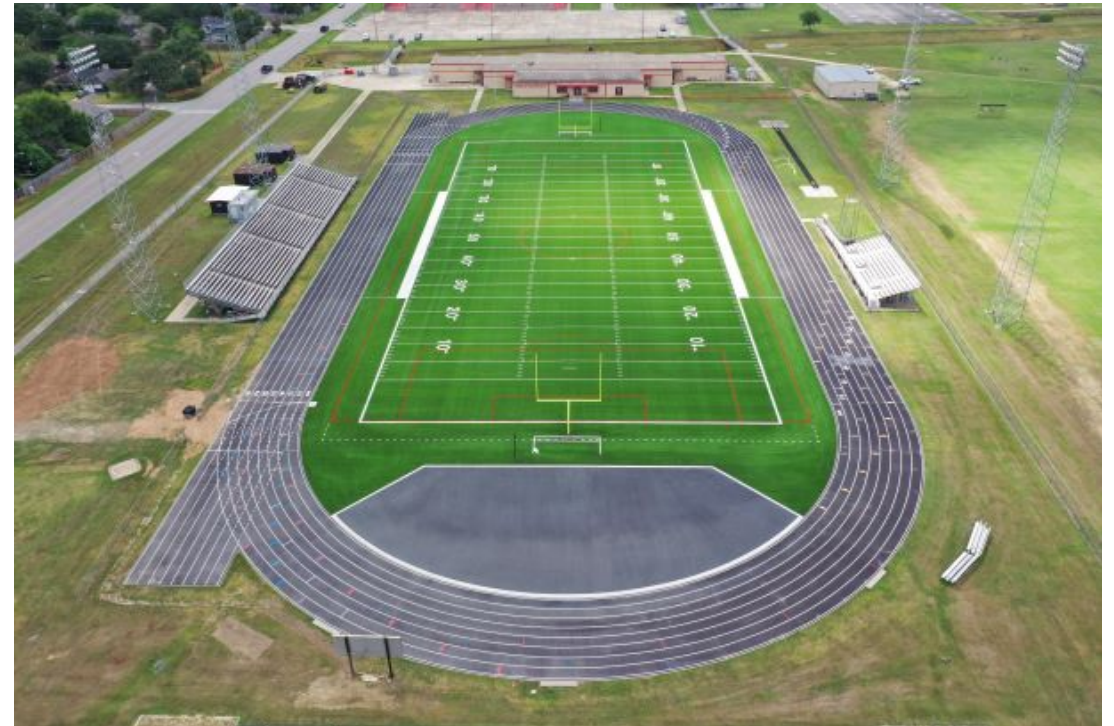
Terry High School