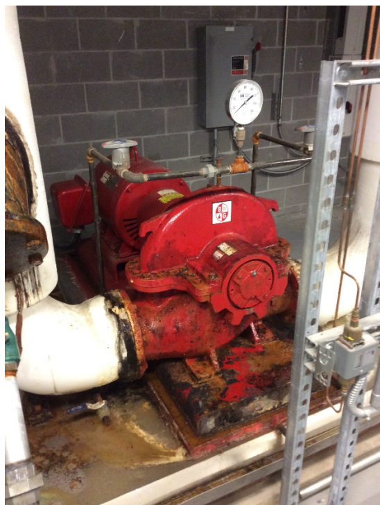
Replace Chilled Water Pump (Life Cycle)