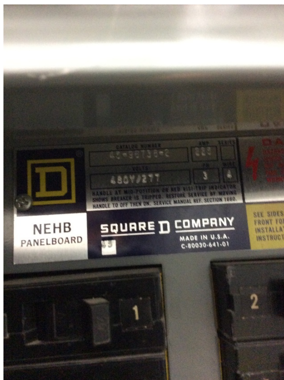
Replace Circuit Breaker