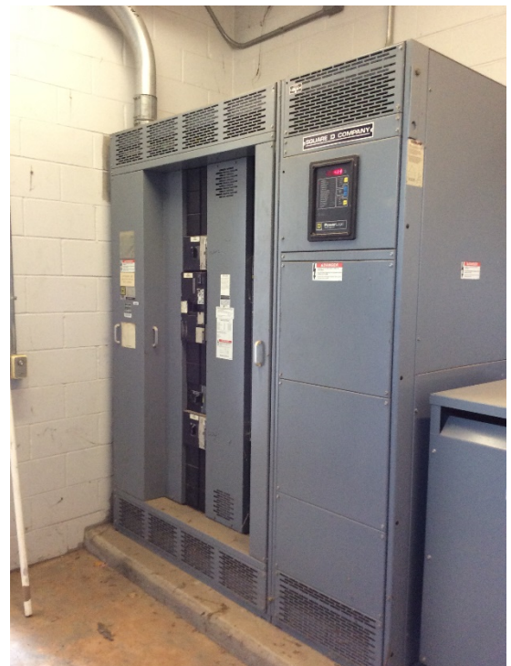
Replace Electrical Switchgear (Life Cycle)