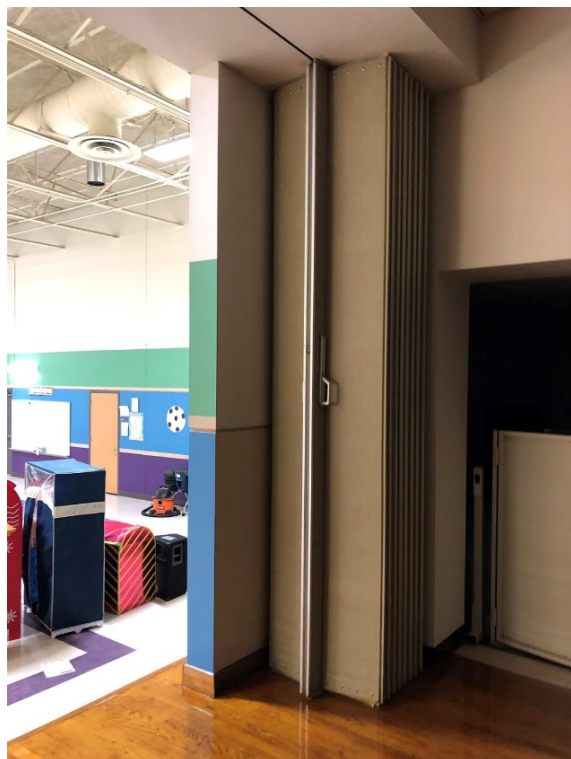
Install Stage Curtain