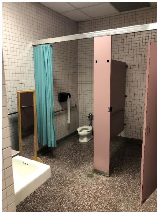
Renovate Student Restrooms