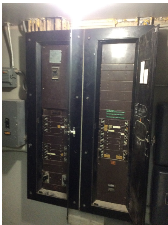
Replace Distribution Panel