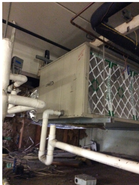
Replace Fan Coil Units (Life Cycle)