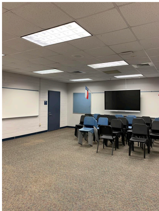
LED Lighting Upgrade