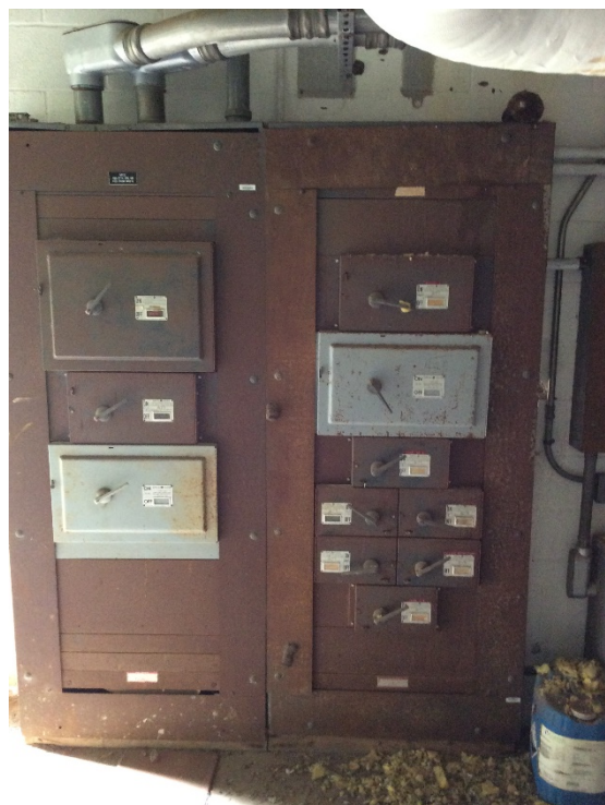
Replace Service Entrance Switchgear