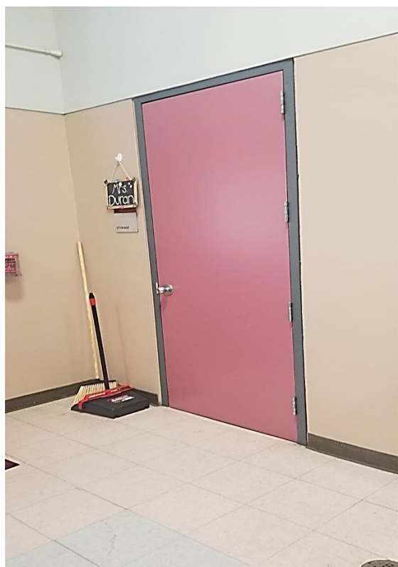
Replace Door Hardware