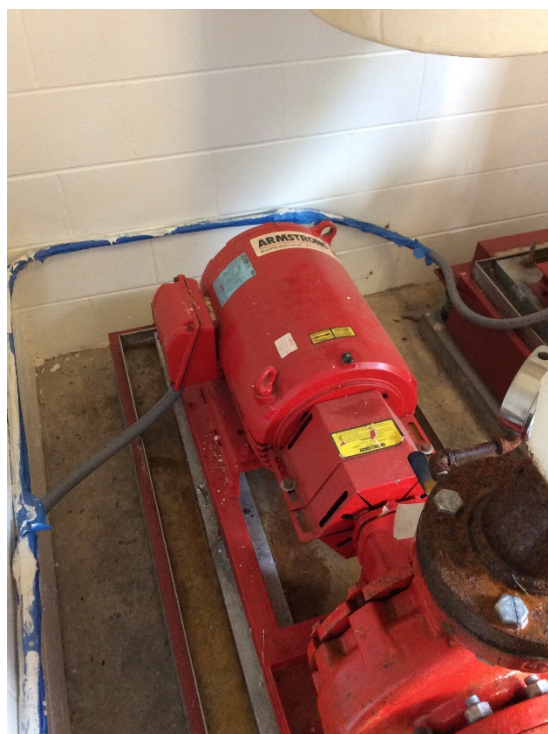
Replace Pumps (Life Cycle)