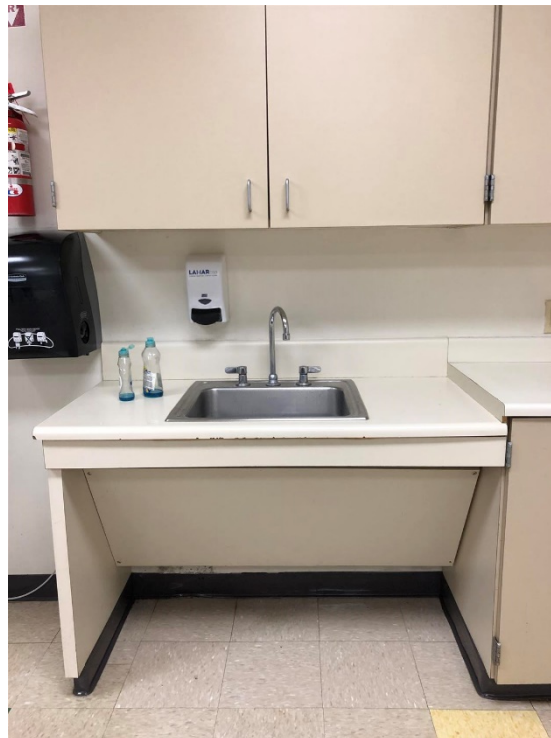
Replace Casework in Teacher's Lounge