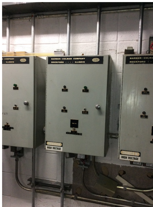
Replace Electrical Switchgear