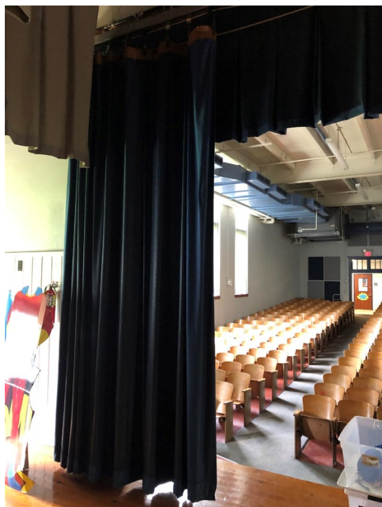
Replace Stage Curtain