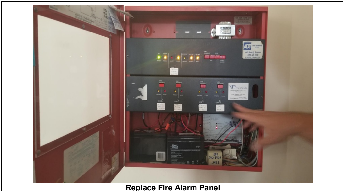
Replace Fire Alarm Panel