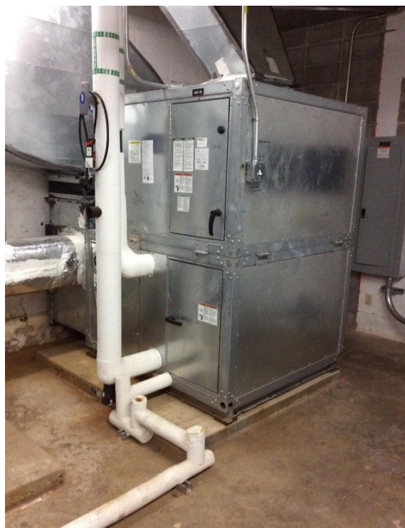
Upgrade HVAC (Life Cycle)