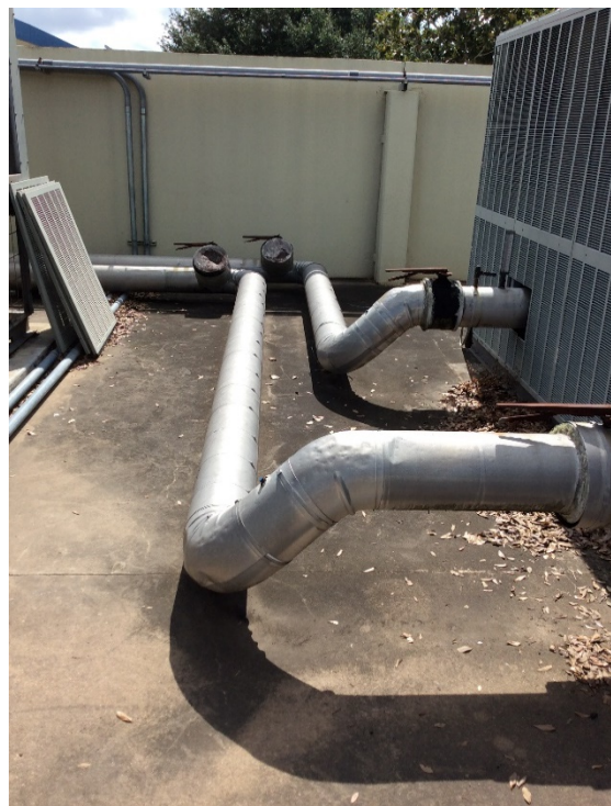
Replace Chilled & Hot Water Piping (Life Cycle)