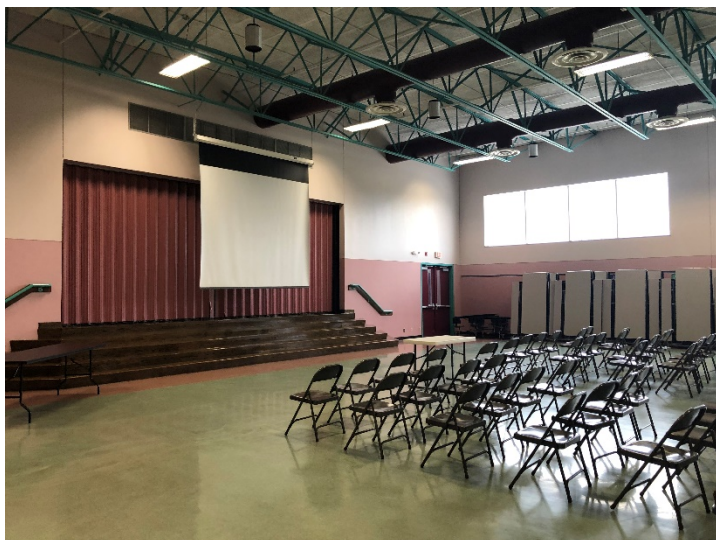
Replace Stage Curtain