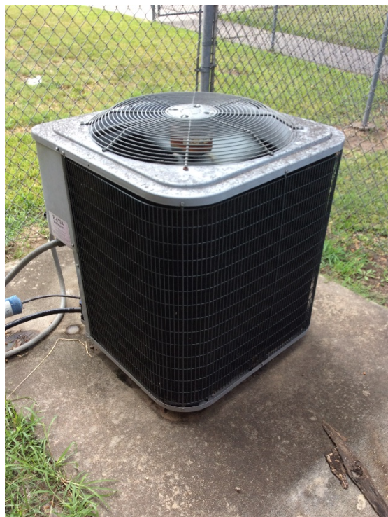
Replace Split System A/C Unit (Life Cycle)