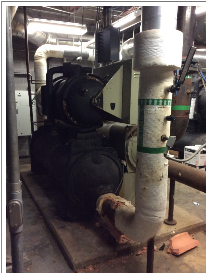
Upgrade Central Plant (Life Cycle)