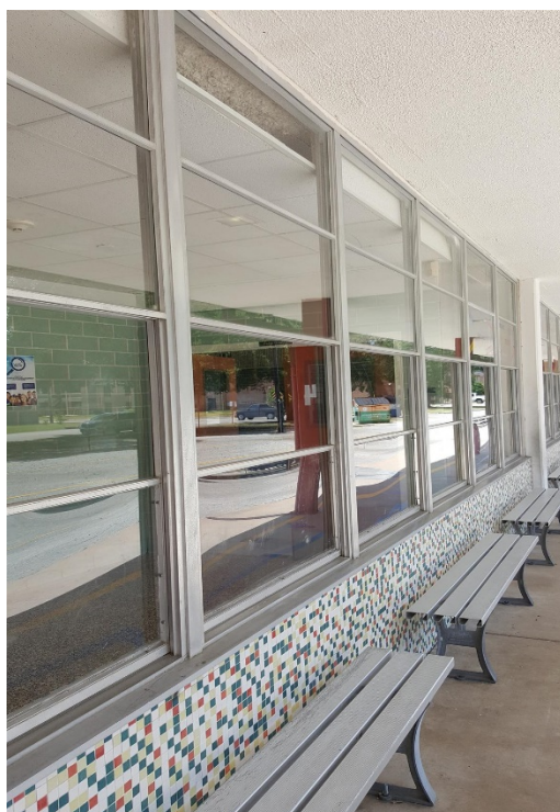
Replace Exterior Windows