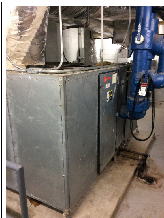
Replace Air Handling Unit (Life Cycle)