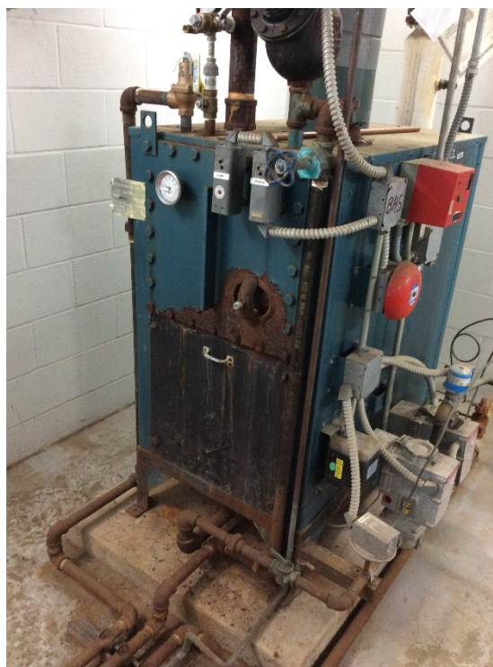
Replace Boiler (Life Cycle)