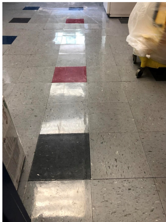
Replace VCT Flooring