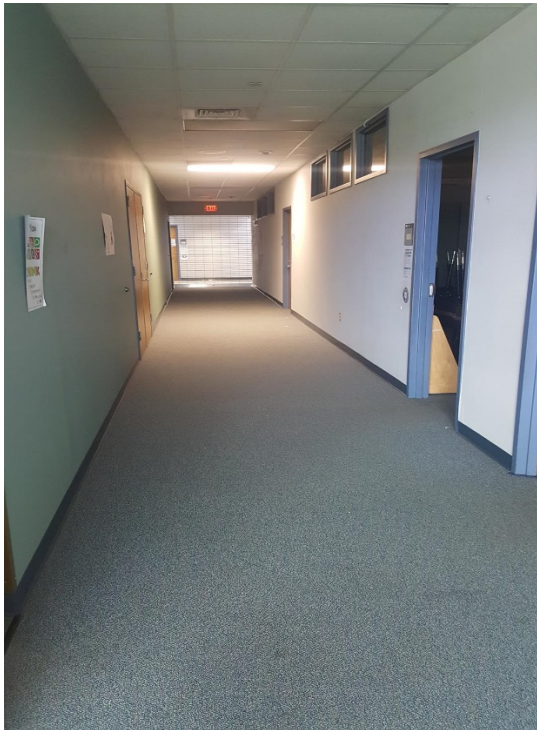
Replace Carpet Throughout (Life Cycle)