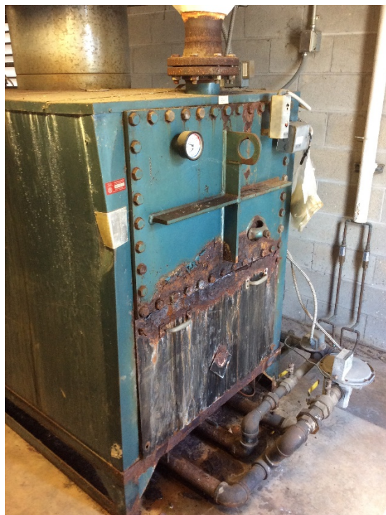
Replace Boiler (Life Cycle)