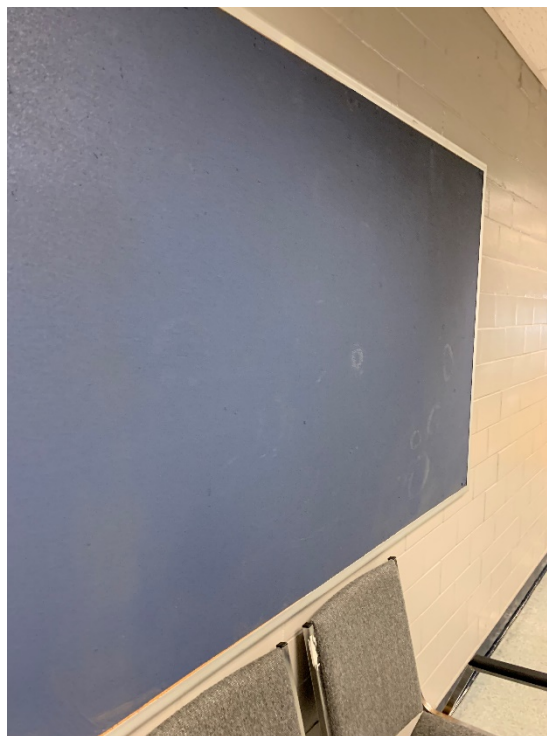
Replace Chalkboards with Whiteboards