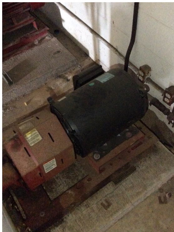
Replace Chiller Pumps (Life Cycle)