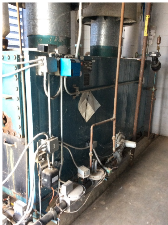
Replace Boiler (Life Cycle)