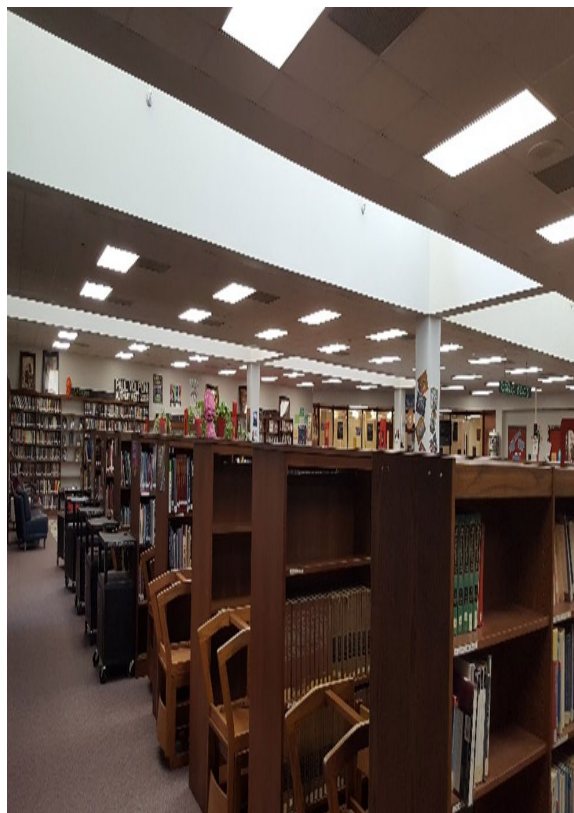
Replace Lights in the Library