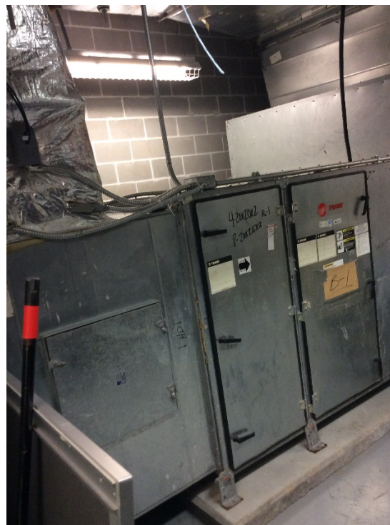
Replace Air Handling Unit (Life Cycle)