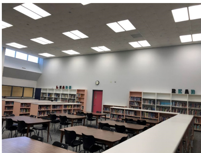
Upgrade HVAC Systems