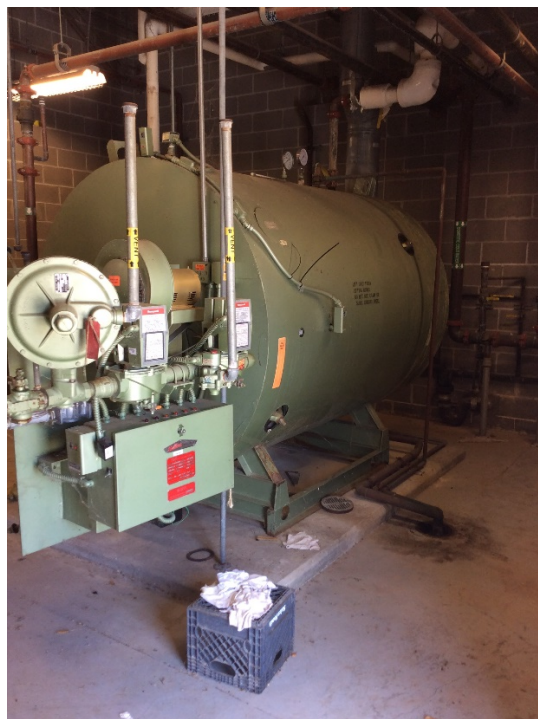
Upgrade Existing Boiler (Life Cycle)