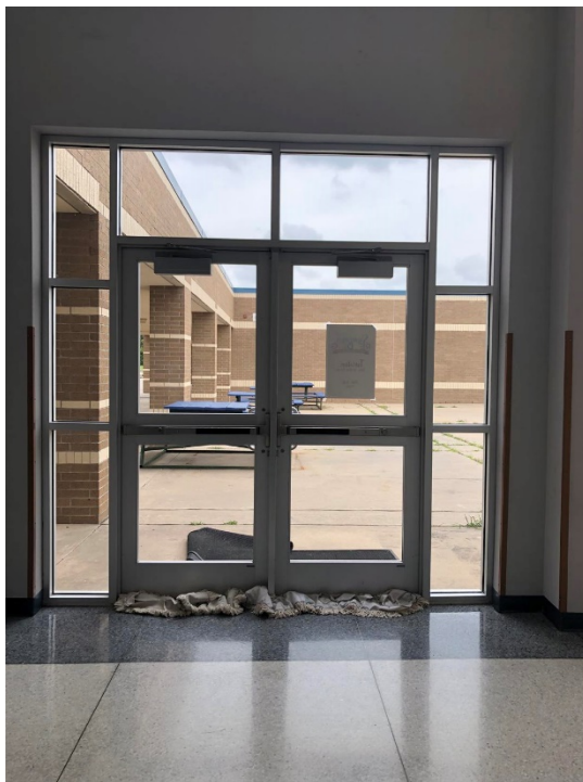
Waterproof & Seal Around Exterior Doors