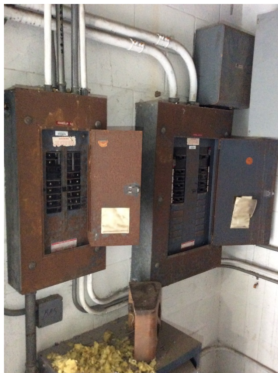
Replace Secondary Switchgear