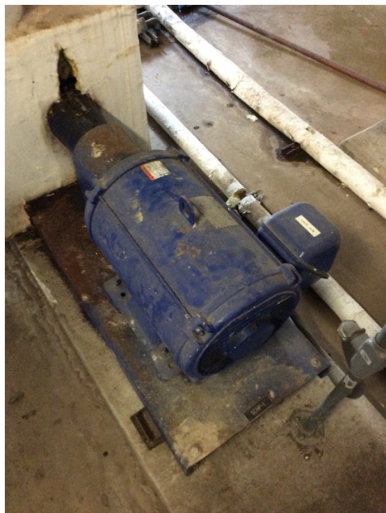
Replace Pumps (Life Cycle)