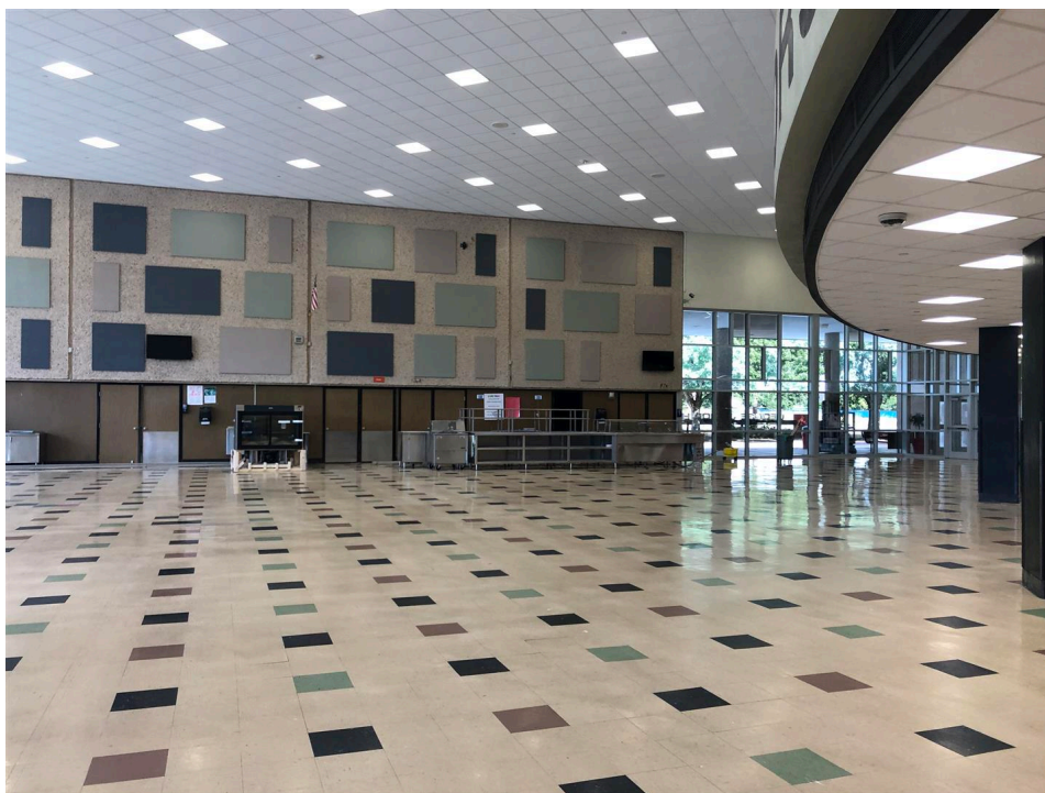
Replace VCT in Dining Area