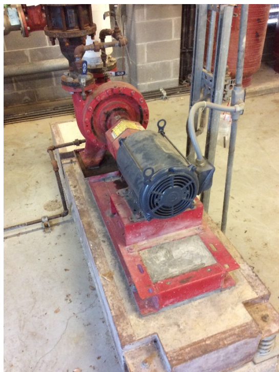
Replace Pumps (Life Cycle)