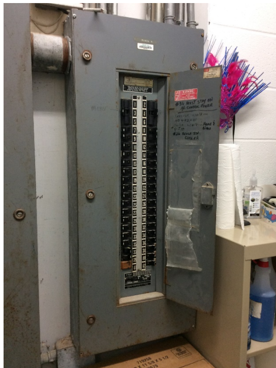
Upgrade Electrical Panel