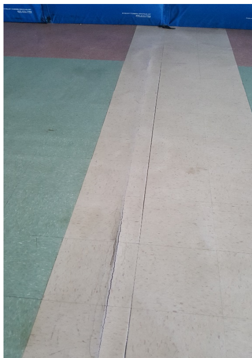
Replace VCT Flooring