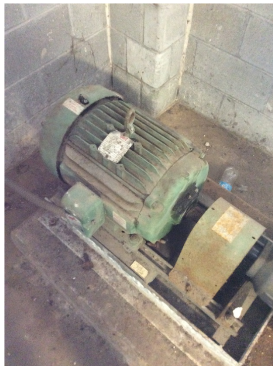
Replace Pumps (Life Cycle)