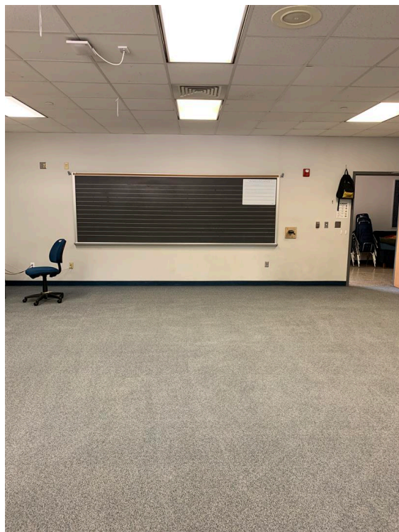
LED Lighting Upgrade