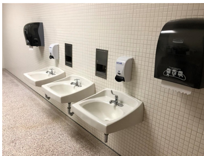
Replace Existing Sinks (Accessibility)