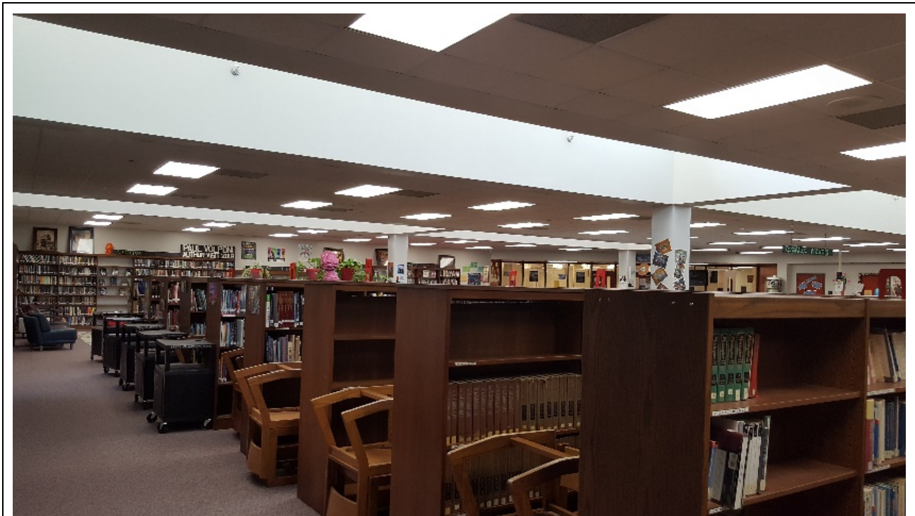
Replace Lights in the Library