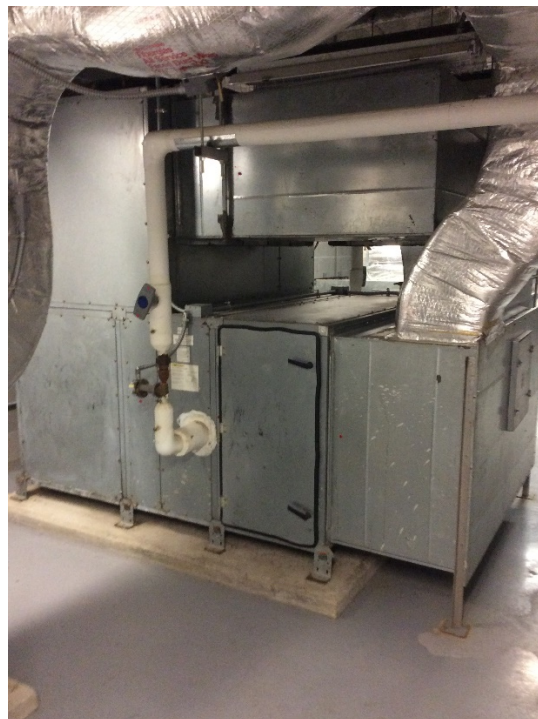
Upgrade HVAC Systems (Life Cycle)