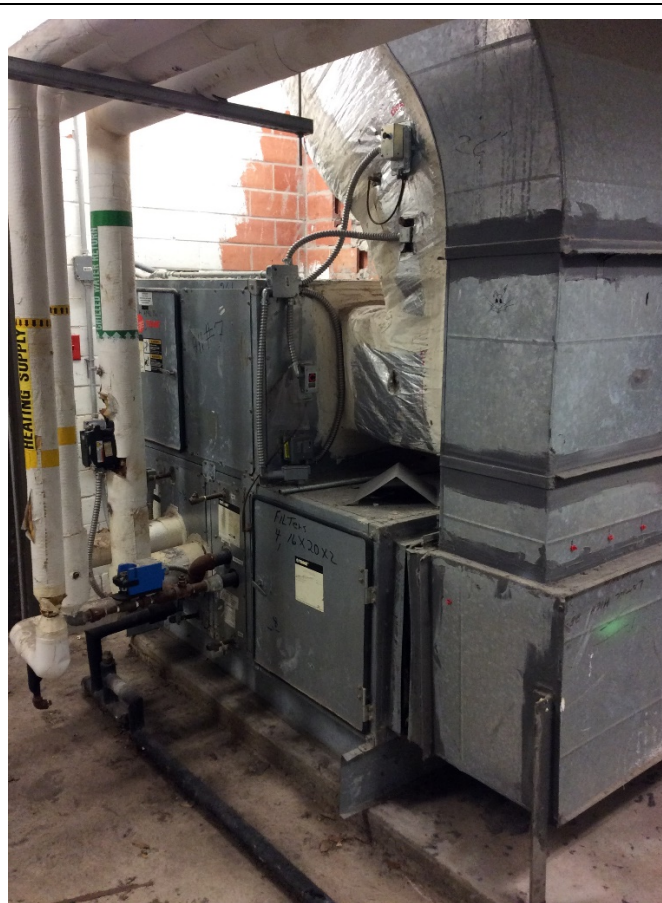
Upgrade HVAC (Life Cycle)