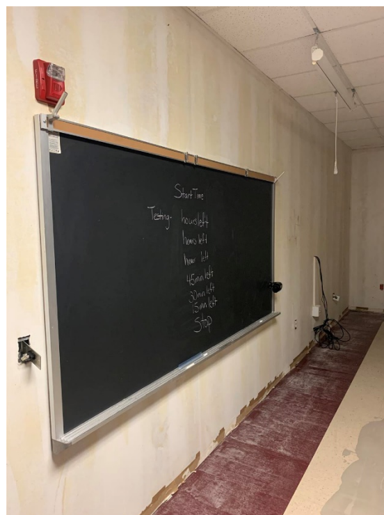
Replace Chalkboards with Whiteboards