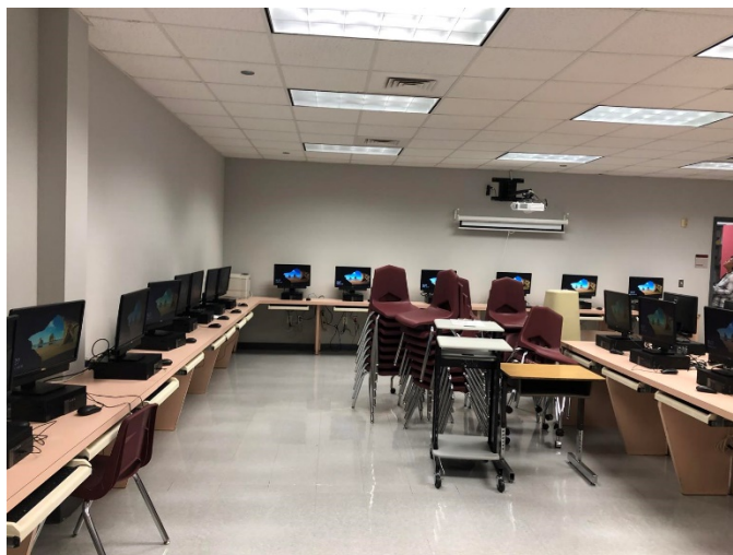
Replace Computer Lab Casework