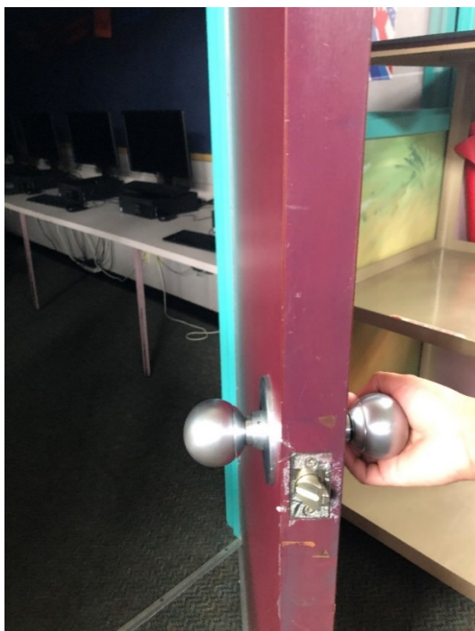
Replace Doors and Hardware