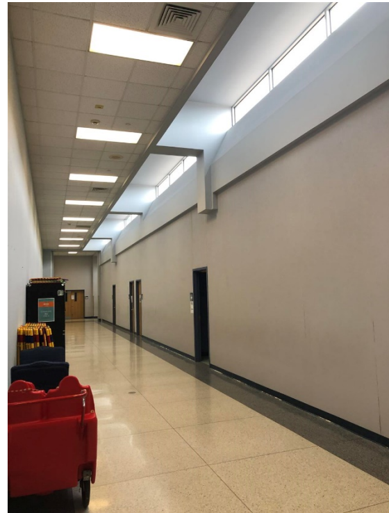
Replace Vinyl Wall Covering