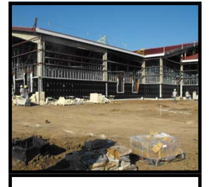
Polly Ryon Middle School