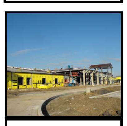
Judge James C. Adolphus ES