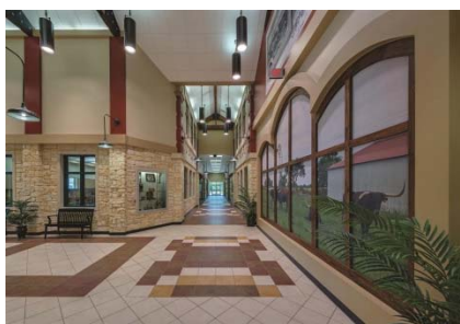
Polly Ryon Middle School