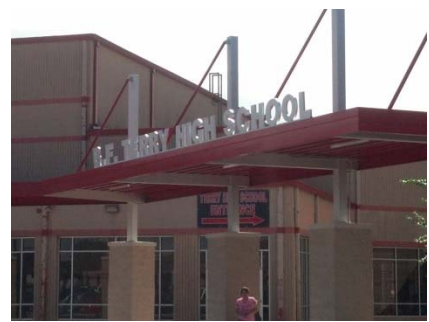
BF Terry High School