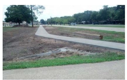
Bowie Elementary School