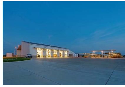
Satellite Transportation Center