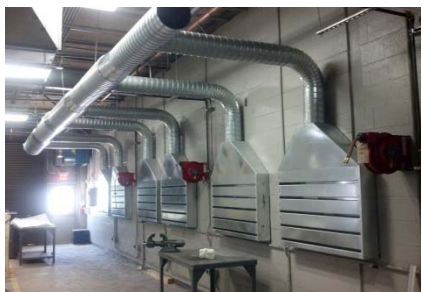
Lamar High School