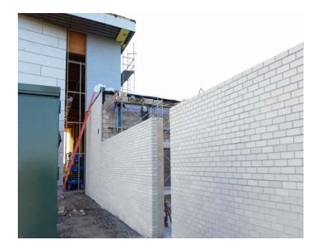
The District Natatorium is a new 36,000sf competition swimming facility with a 7 lane heated pool, diving well, weight room, classrooms, offices, spectator seating and judges stands. The complex is located adjacent to Traylor Stadium in Rosenberg, TX.