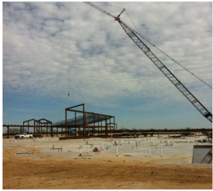
Dean Leaman JHS is part of a new 101 acre campus in Fulshear, TX. It includes a 203,000sf building for 1200 students, teacher and visitor parking, separate bus drop-off, competition & practice ball fields, dual gymnasiums and dedicated CTE spaces.