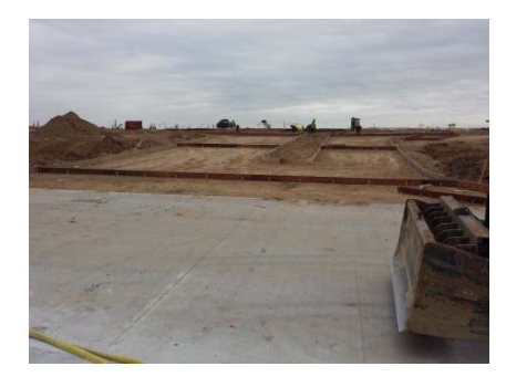
Churchill Fulshear (Jr.) HS is part of a new 101 acre campus in Fulshear, TX. It includes a 350,000sf main building for 2000 students, 32,400sf field house, teacher and student parking, separate bus drop-off, dual gymnasiums, dedicated CTE spaces, competition & practice ball fields, tennis courts and band practice areas.