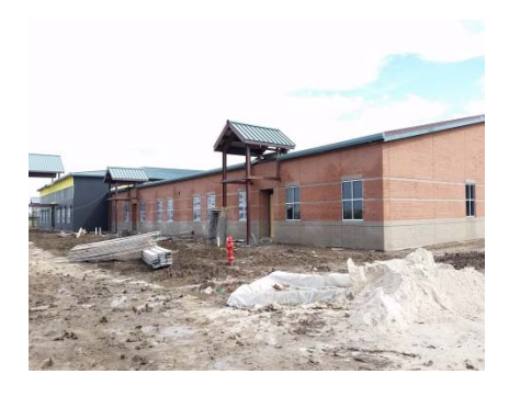
Arredondo ES is a new 12 acre campus for 750 students consisting of a 90,700sf building, parking & play areas located in Summer Parks subdivision in Richmond, TX