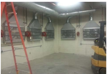
Foster High School