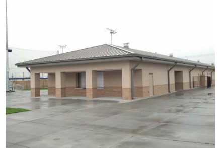
Lamar HS baseball/softball complex