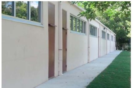
Austin Elementary School