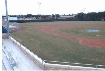
Lamar HS baseball/softball complex