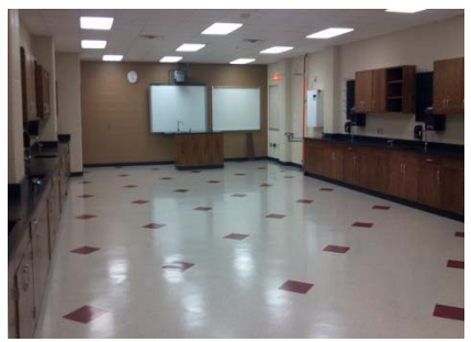
George Ranch HS Shell Build-Out