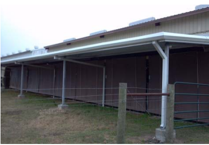
Ag Barn renovations