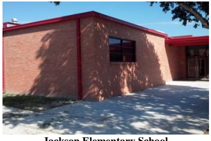
Jackson Elementary School