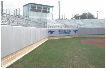
Lamar HS baseball/softball complex