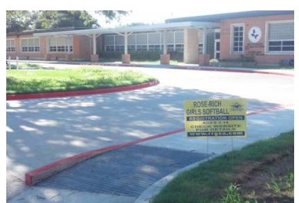
Travis Elementary School