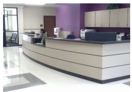
Alternative Learning Center