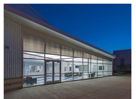
Satellite Transportation Center